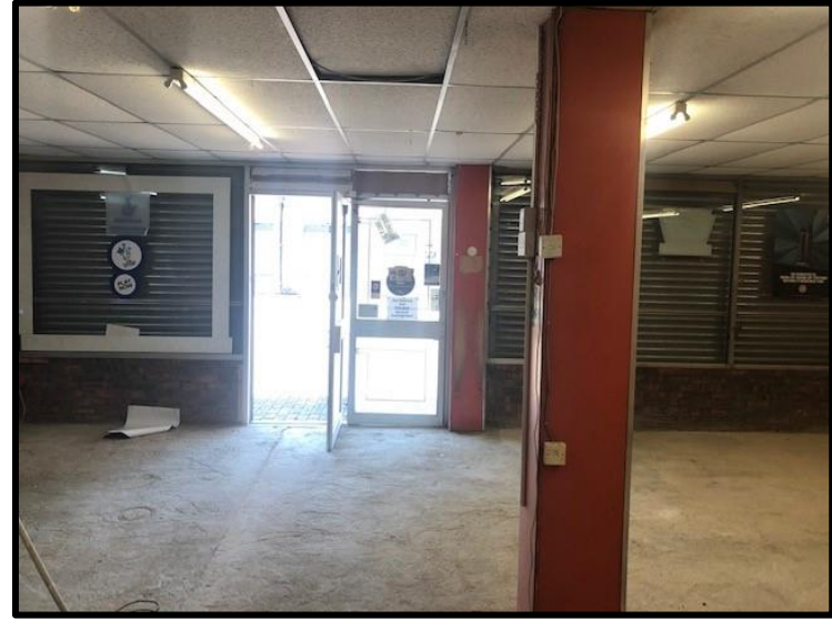
Unit 2 Unit 4