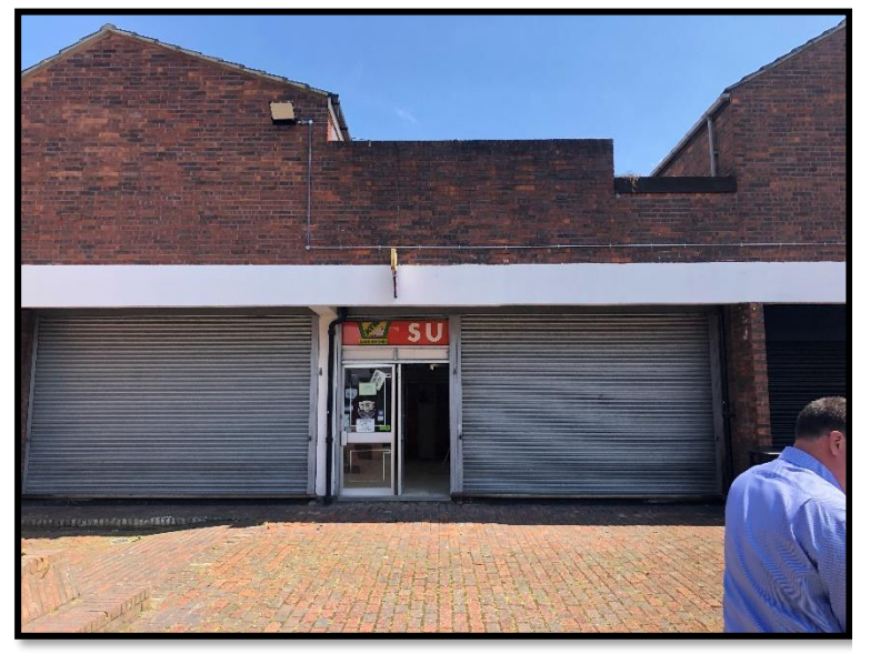
Unit 2 Unit 4